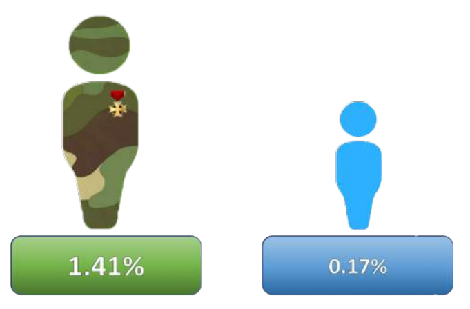
Veterans were over eight times as likely as non-veterans to exhibit problem gambling

The proportion of veterans reporting problem gambling was 1.41%, which was significantly higher than the proportion of non-veterans reporting problem gambling (0.17%). In addition, male veterans were more likely than male non-veterans to have experienced a traumatic event. However, this difference did not explain the difference in problem gambling between the groups — individuals who had experienced trauma were not more likely to show problem gambling behaviour than those who had not.