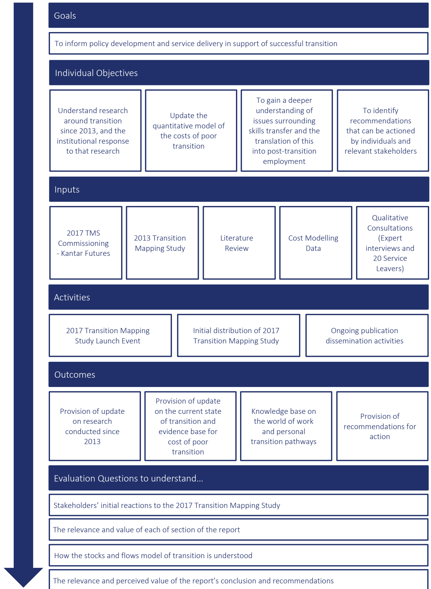
Table 1: Evaluation Framework