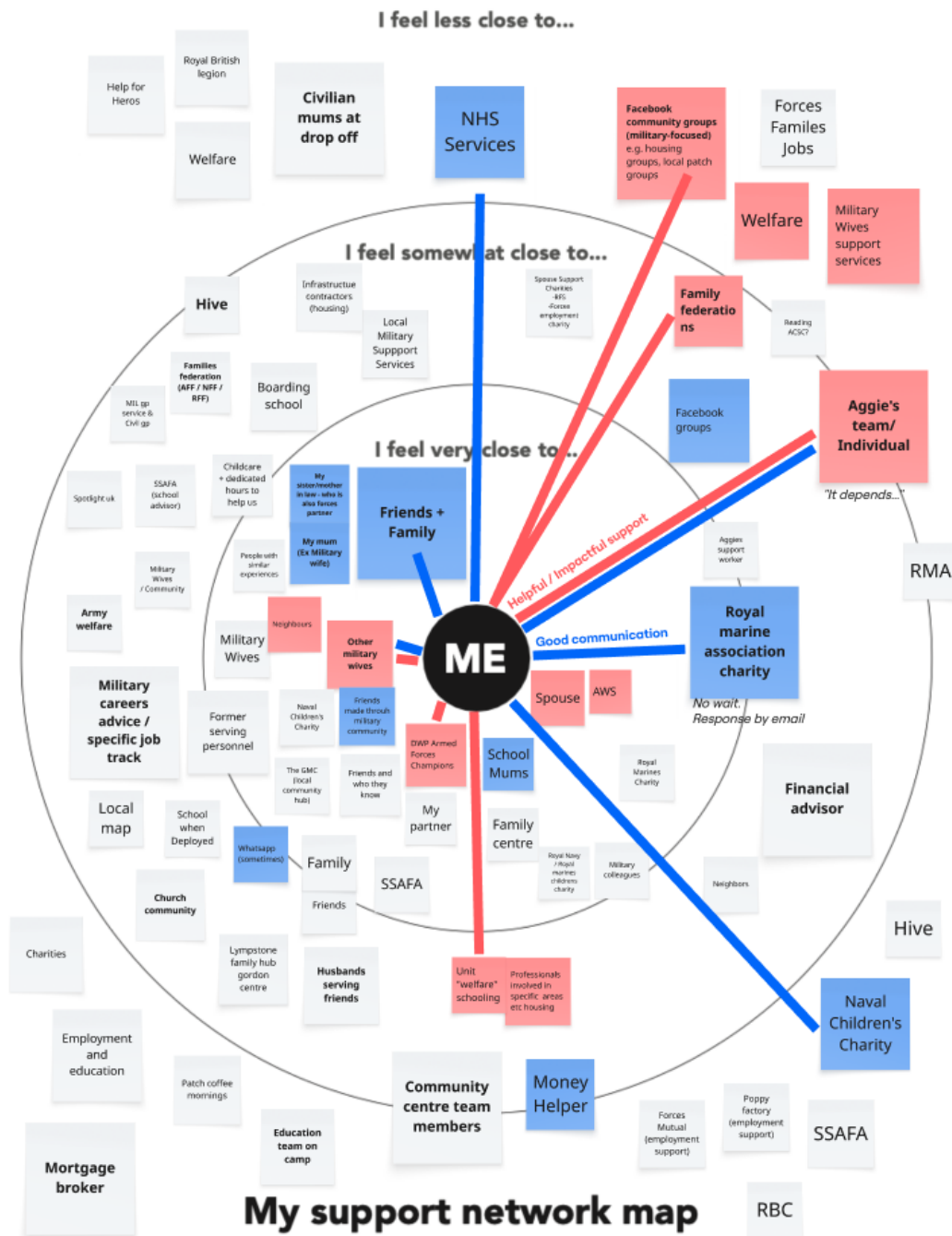
Map 1. Combined input from five co-creation workshop groups